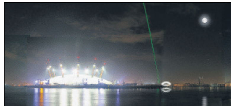
A vision of how Aluna may light up the Greenwich Peninsula

SATURDAY 17 APRIL 8pm AN EVENING WITH SHAPPI KHORSANDI 'Britain's best young female comic by any yardstick' The Guardian TICKETS: £15 (£13 concessions)